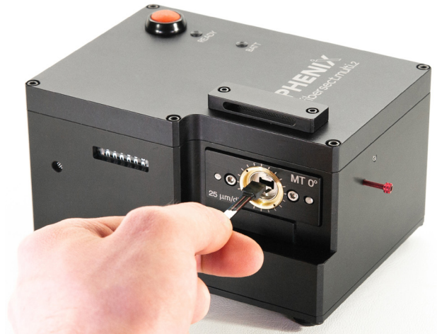
Inserting the MT connector

The fibersect.multi.2™ quickly cuts off the epoxy and fibers protruding from the face of connector ferrules during the installation process. In less than a second, it produces a flat cut close to the ferrule face, creating the ideal surface for polishing. Throughput is improved by eliminating manual steps such as hand cleaving, de-nubbing and epoxy removal. The multi.2 is optimized for cutting 4 to 72 fiber MT ferrules as well as large diameter fibers used with SMA connectors. With a simple one button operation, small footprint, and battery power, the fibersect.multi.2 provides exceptional versatility, portability, and ease of use in the production environment.